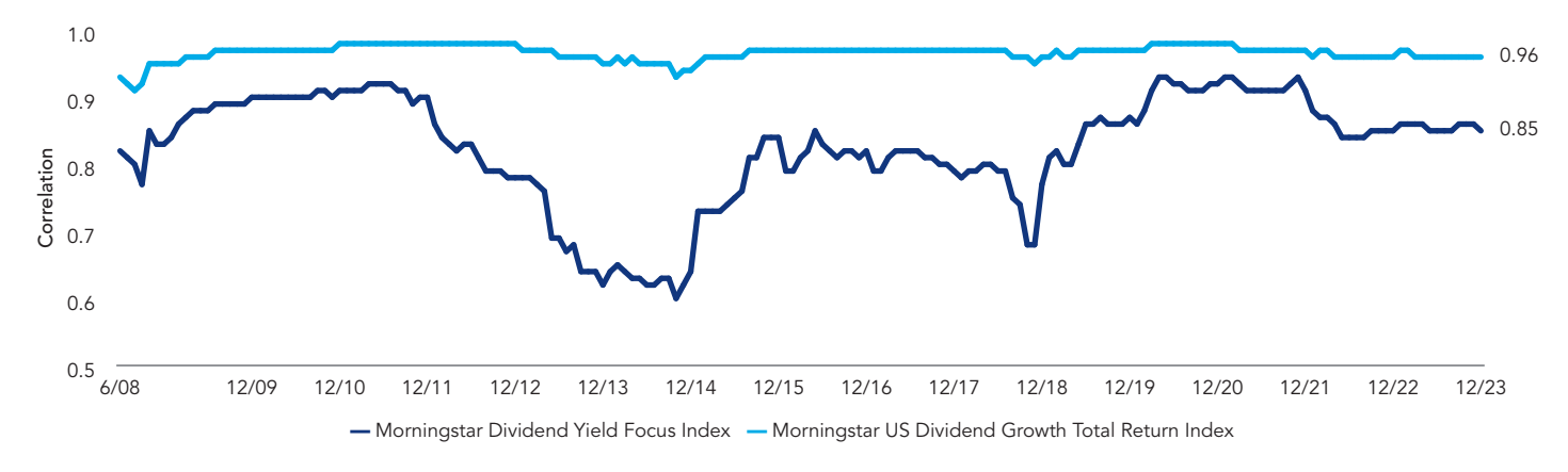
Exhibit 1: Dividend strategies' rolling three-year return correlation to the Russell 1000® Index Morningstar Dividend Yield Focus Index and Morningstar US Dividend Growth Index 6/30/08 - 12/31/23