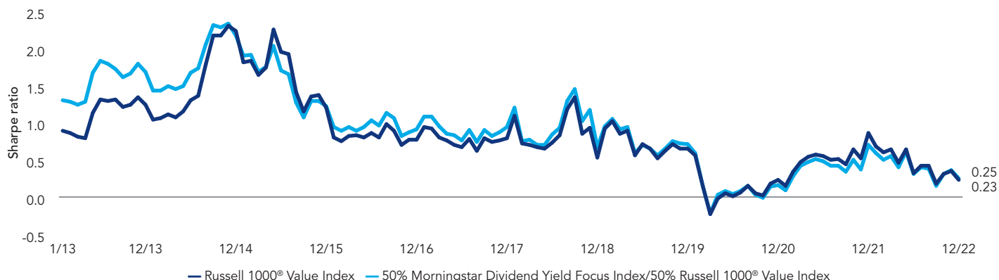
Exhibit 3: Rolling three-year Sharpe ratios

Sources: Morningstar, Inc., Federated Hermes; though December 31, 2022